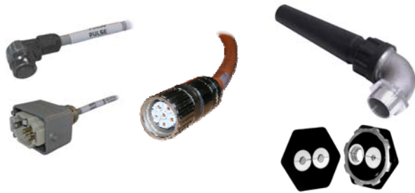
Cables & Grips