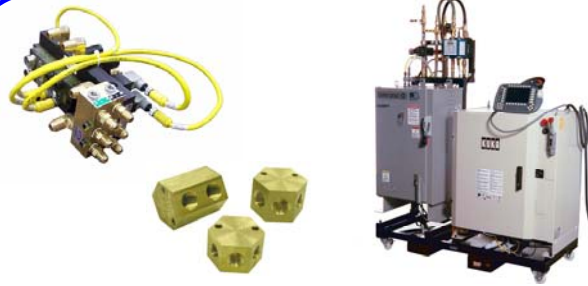
Support Assemblies & Manifolds