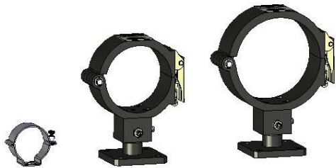
Clamps & Inserts