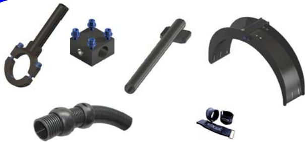
Brackets & Cable Management