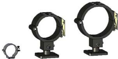
Clamps & Inserts