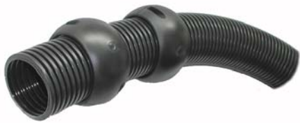
Corrugated Tube & Wear Bands

Please see our other products for further design solutions