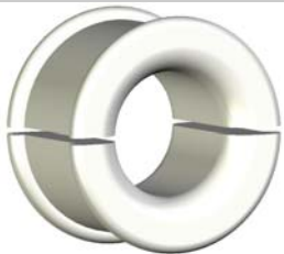
Single Hole Insert