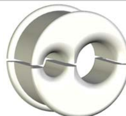
Dual Hole Insert