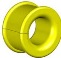
Single-Hole Insert Shown