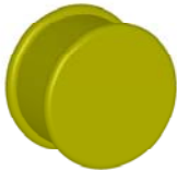
Blank Insert Shown