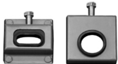
7000 Series Cage Bushings

Notice: The information contained herein is, to the best of our knowledge, true, accurate and reliable. Since procedures and conditions under which these products may be used are beyond our control, no warranty, expressed or implied, is made to their performance.