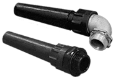
3000 Series Strain Aids

Please see our Strain Relief products for further design solutions