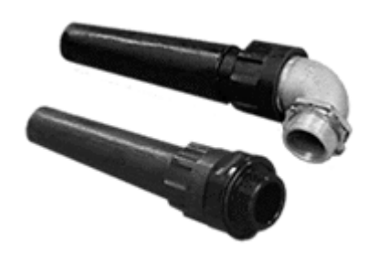
3000 Series Strain Aids