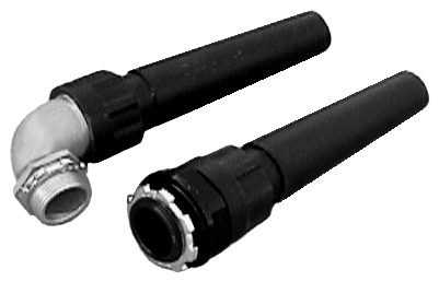
3000 Series Strain Relief