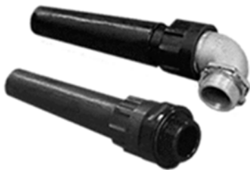
3000 Series Strain Aids

Please see our Strain Relief products for further design solutions